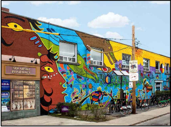
GRAFFITI STYLE MURAL